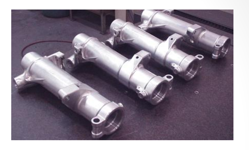
Aerospace and Defense