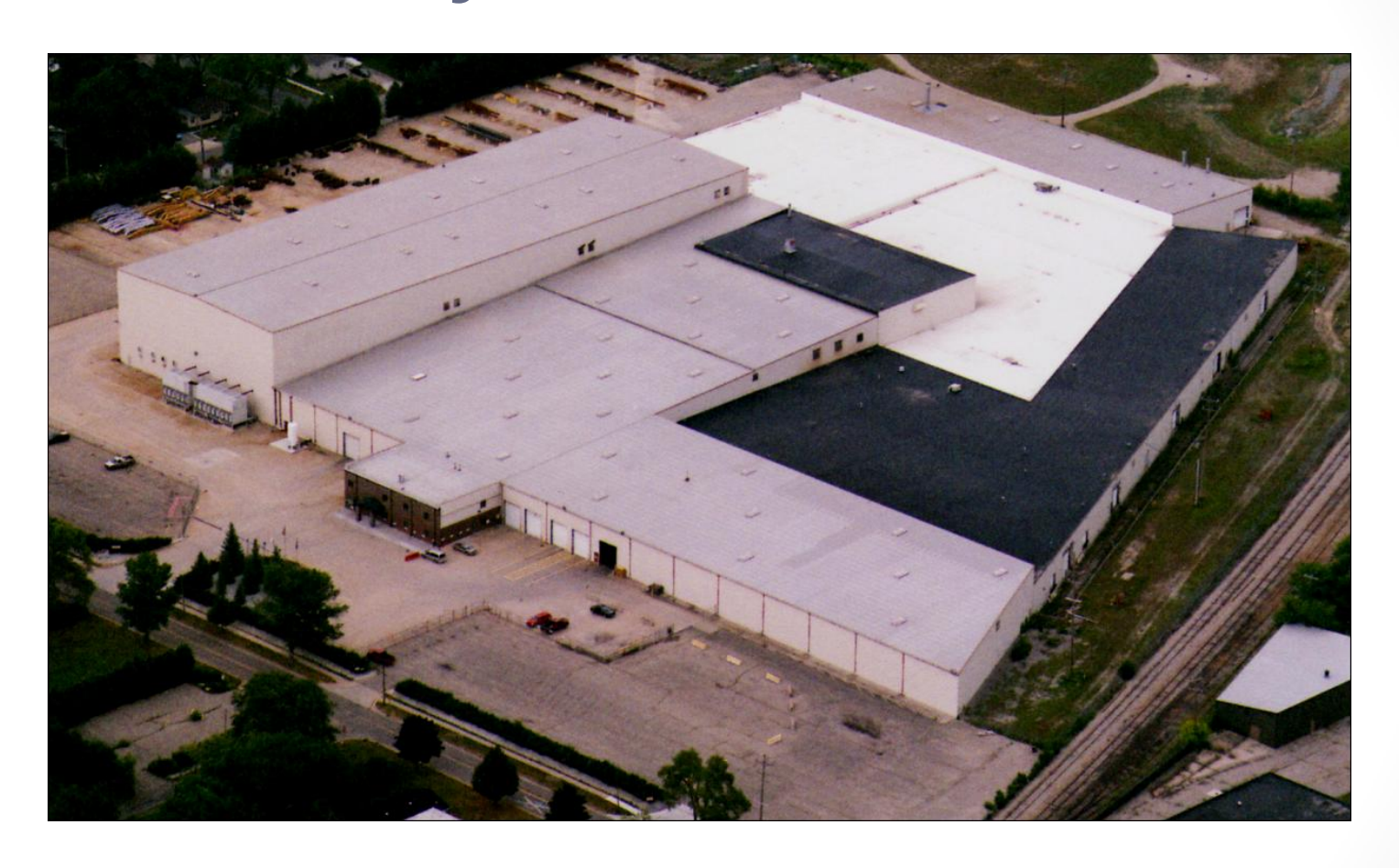
400,000 square feet, currently with 190 employees