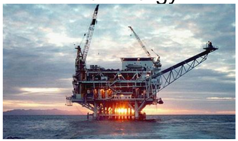
Chemical & Petroleum Processing