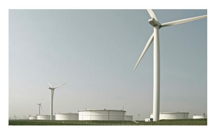
Solar and Wind Energy